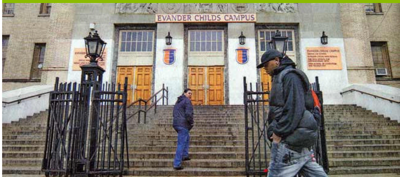
Ex-Problem - My old school, Evander Child High School, in the Bronx, was an "impact school", getting the attention of specialists in public security, the police, and school safety local agents to reduce violence and disorder.

The next articles on school reform in this series by the staff of the Fernand Braudel Institute of World Economics will be published on alternate Sundays in O Estado .